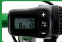
Digital LCD display