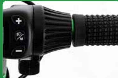
Twist grip throttle