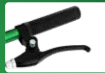
Manual hand brake