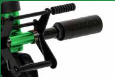
Supplemental foot brake