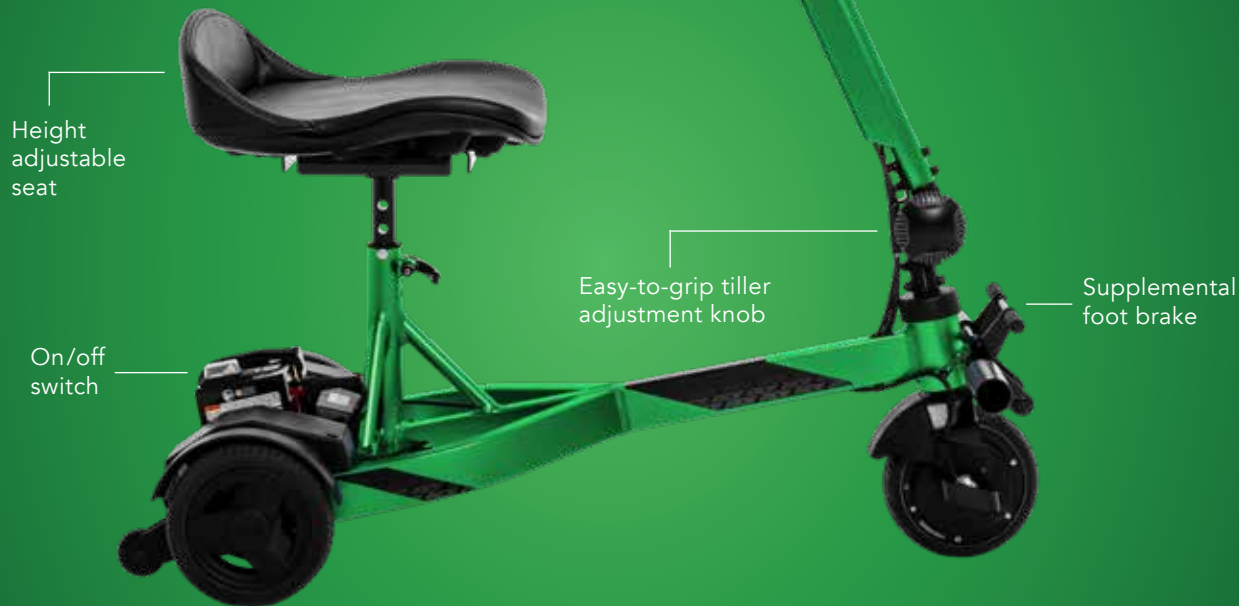
Height adjustable seat